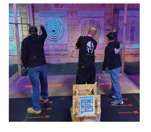
8-9 GET INVOLVED

CRBRA.com, e-blasts and social media keep you informed